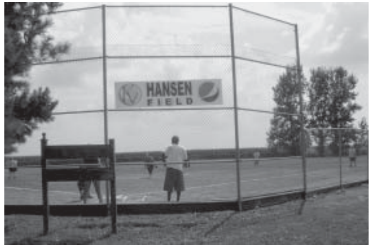
Thank you to Pepsi for the new Hansen Field sign. The site of a few really fun games this summer, go Kemmerer Village Knights!