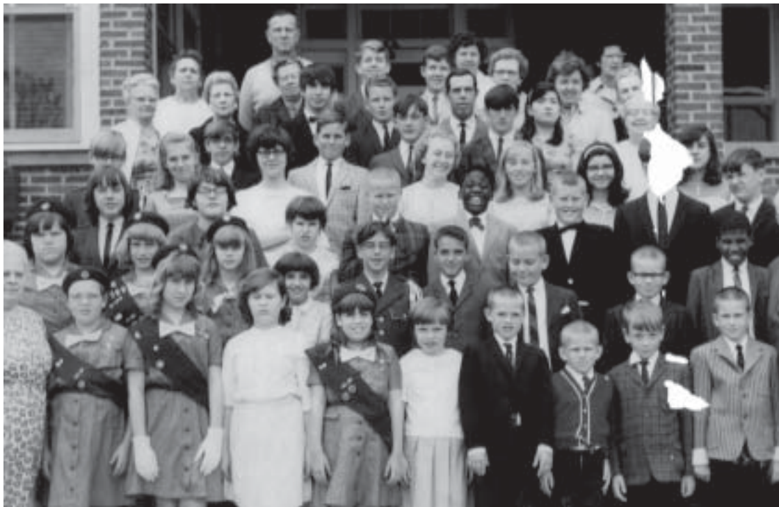
Kemmerer Village Residents - 1960's