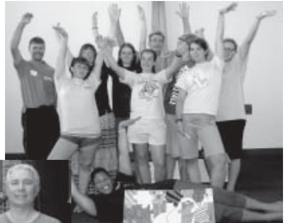
La Porte, IN Presbyterian Church

Mt. Zion Presbyterian Church also visited us this summer. We regret that we did not get a picture of their group.