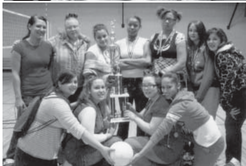
A variety of sports opportunities are available to the youth at Kemmerer Village. Our young people compete with other child care agencies in basketball, volleyball, softball, track, swimming. Above are photos of the Kemmerer Village girls teams the Knights who won trophies in volleyball and basketball.