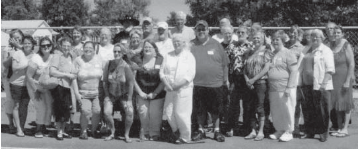
August 14, 2010 photo of former residents at reunion.