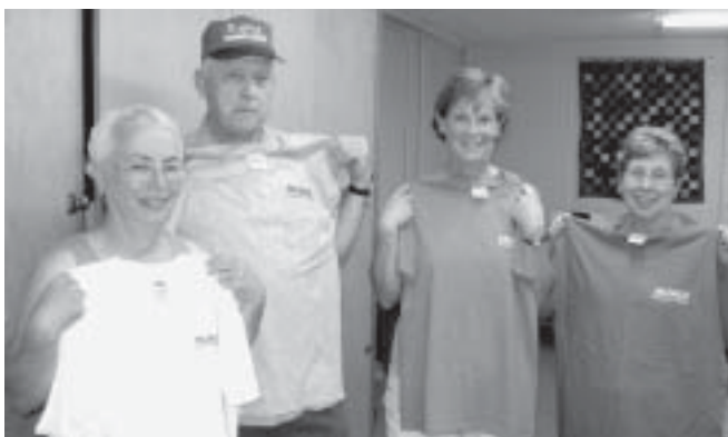
First Presbyterian Church - Morris, IL