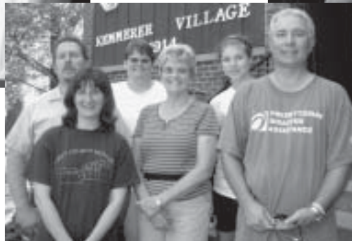
First Presbyterian Church - Jacksonville, IL