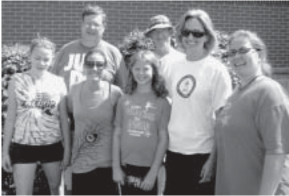
Decatur Presbyterian Church - Decatur, IL

We truly appreciated all the work that was done on our campus this summer. This time of year is always very busy for our staff. Your helping hands made a tremendous difference in caring for our 60-acre campus. We especially thank you for helping with the Indoor Riding Arena. We also enjoyed getting to know all of you and letting you get to know us. Hope to see you on campus again.