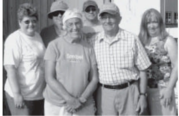
Freeport Presbyterian & Gibson City First Presbyterian