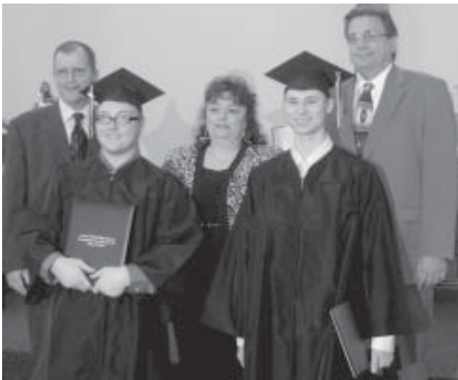
Kemmerer Village High School Graduation 2010.