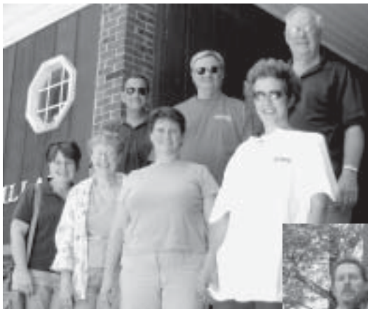
First Presbyterian Church Monticello, IL

Mt. Zion Presbyterian Church also visited us this summer. We regret that we did not get a picture of their group.