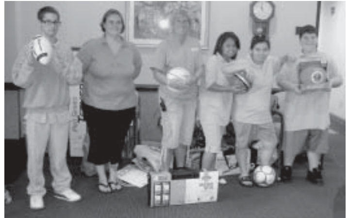
First Presbyterian Church, Effingham, IL, donated items for summer activities.