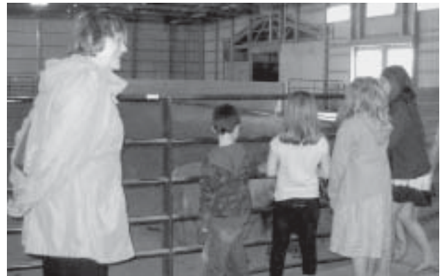
Mattoon Presbyterian youth visited the campus.