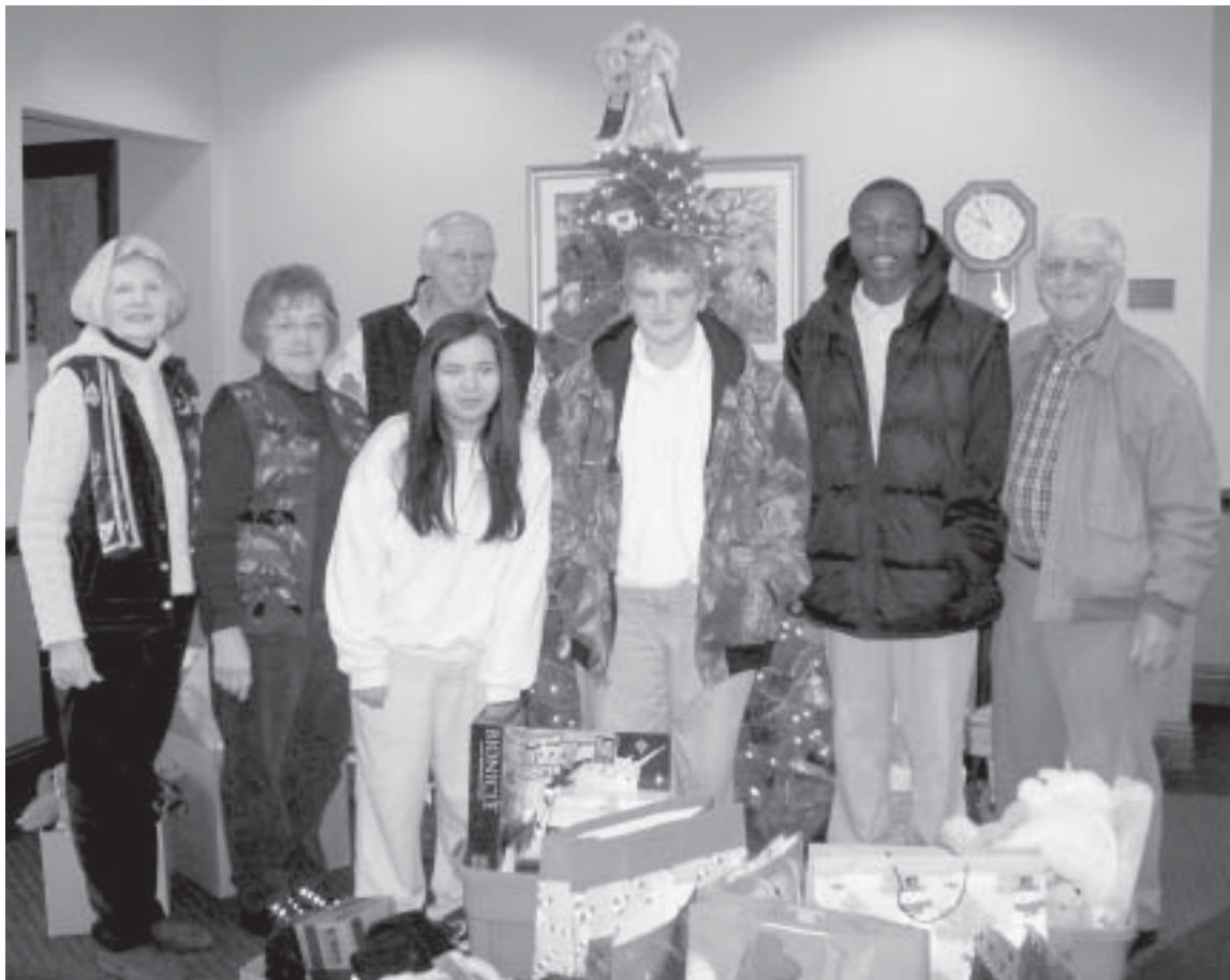
First Presbyterian Church of Effingham was one of the congregations who helped make Christmas 2009 a very special time for our youth.

The children and staff at Kemmerer Village would like to send out a big “Thank You” to everyone who helped make our 2009 Christmas a most memorable time for our young people. A wonderful Christmas was celebrated by all of the 124 children in our Residential and Foster Care Programs. Thank you to all the congregations, organizations and individuals who helped fulfill dreams, possibly for the first time for many of our youth.